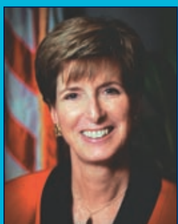
EPA Administrator Whitman